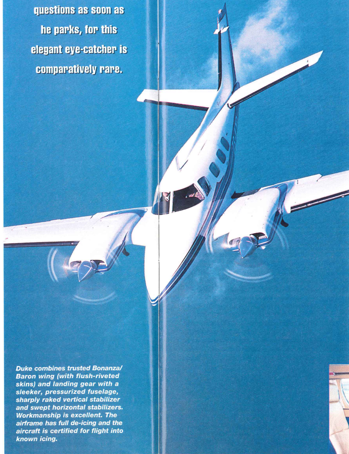
Duke combines trusted Bonanza/Baron wing (with flush-riveted skins) and landing gear with a sleeker, pressurized fuselage, sharply raked vertical stabilizer and swept horizontal stabilizers. Workmanship is excellent. The airframe has full de-icing and the aircraft is certified for flight into known icing.

The proud owner can expect to start answering questions as soon as he parks, for this elegant eye-catcher is comparatively rare.