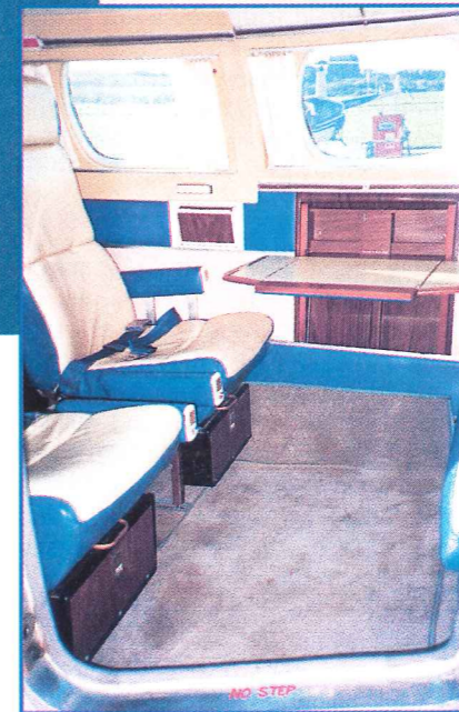
TOP: Everybody boards through a tall door at the left of the rear cabin. The step below extends with the landing gear. ABOVE: The roomy cabin has inward-facing club seating for four with a small fold-away table. The blue-and-white vinyl upholstery and trim are original equipment. The windows are double-glazed and curtained and the right rear seat hides a chemical toilet. LEFT: This final, definitive B60 version had slightly more interior room, gained by leveling the previously sloping rear floor.

Such a heavy airplane (fully loaded, it weighs over 3 tons) must put a strain on its landing gear, and collapses have been a problem from time to time. Graham said one cause is inadequate maintenance of the motors, which lose torque if the brushes become worn, causing the circuit breaker to trip just before the wheels are fully locked down.