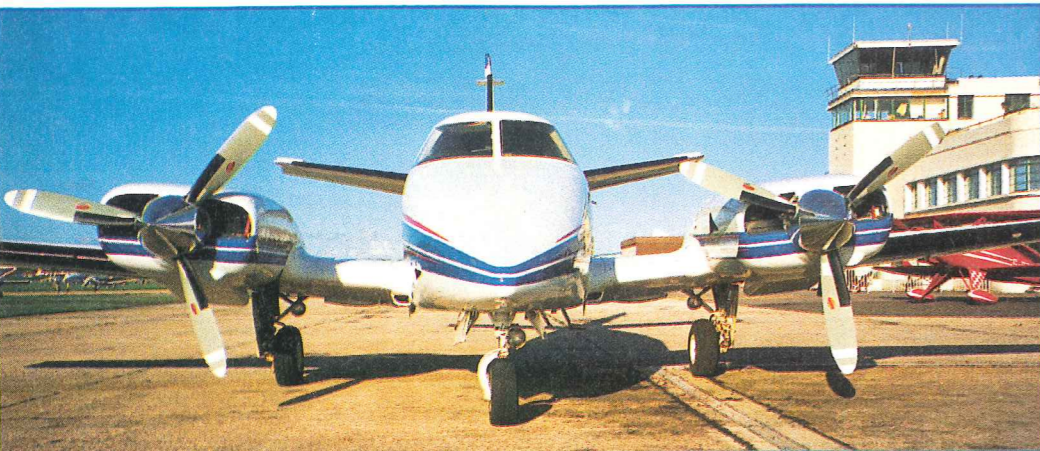
The Duke looks as if it is doing 300 knots, even when parked, and this brawny beast was built before the advent of counterrotating props. The gear legs are a little short and stiff, while the nosewheel twists during retraction to lie flat below the baggage compartment.

thrummed upwards at a very respectable 1700 fpm. With just three men aboard and 480 pounds of fuel, we weighed perhaps 5,830 pounds, or nearly 1,000 pounds less than the 6,775 maximum. The published full-power climb rate at top weight is 1600 fpm, and the Duke will maintain this well up to the mid-tens of thousands of feet. Graham says he routinely climbs to 24,000 feet in under 30 minutes from a max-weight takeoff.