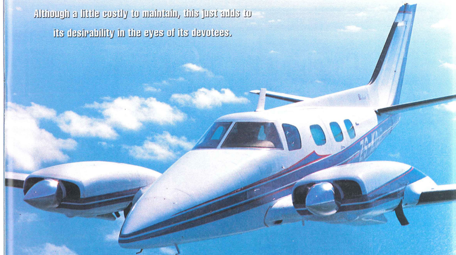
The powerful and tolerant 380-hp Lycomings are like those in the much larger Navajo Chieftain. They have slightly old-fashioned (but necessarily substantial) squarish cowlings.

Although a little costly to maintain, this just adds to its desirability in the eyes of its devotees.